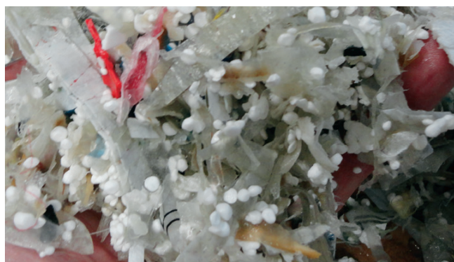
Fiber-free rejects including troublesome styrofoam and plastics

High removal of light contaminants such as plastics, polystyrene, and styrofoam