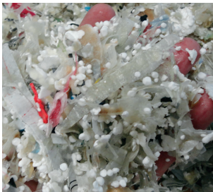
Fiber free rejects

Coarse stock cleaning of low density debris