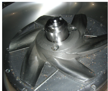
Float Purger rotor and bed plate

General dimensions - not certified for construction or installation. Guards are omitted for clarity; but perimeter guards are recommended.