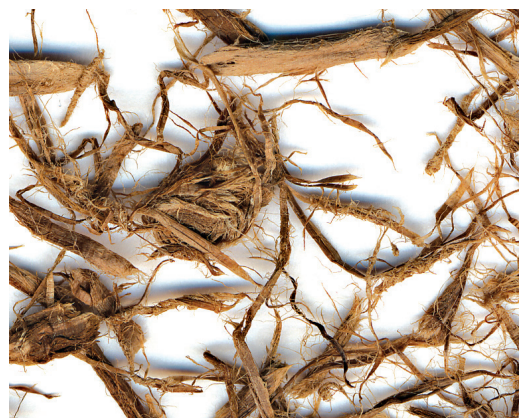
Rejected shives - ready for further processing.