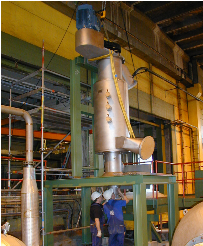
Raditrim-F tailing fine screen installation