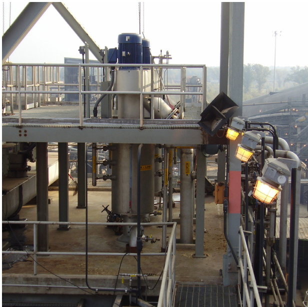
Raditrim-F tailing fine screen installation