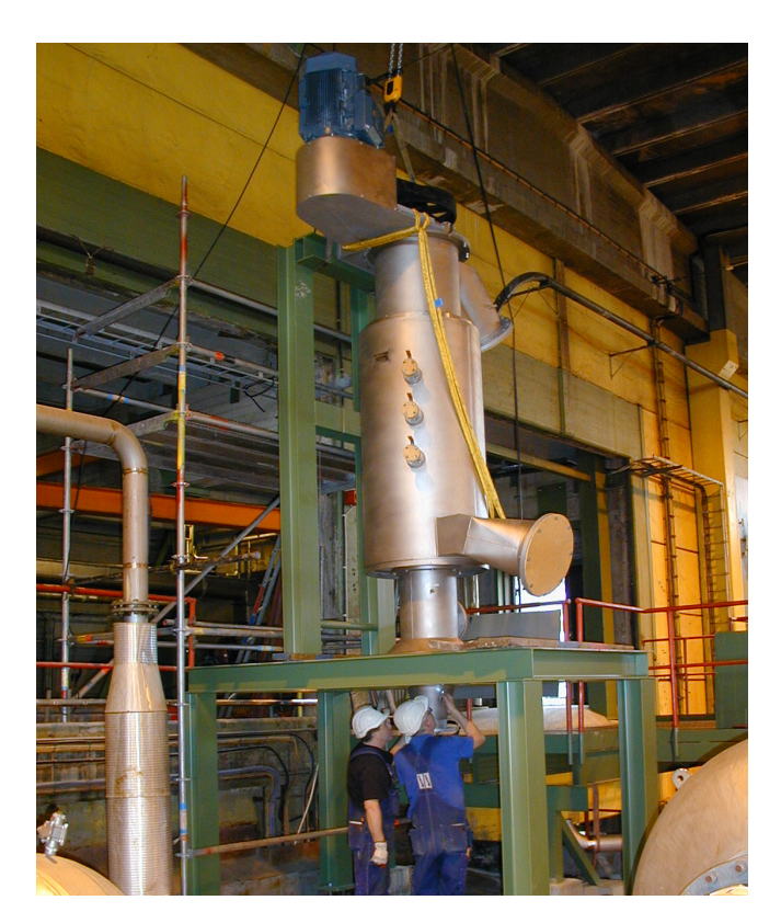
Raditrim-F tailing fine screen installation