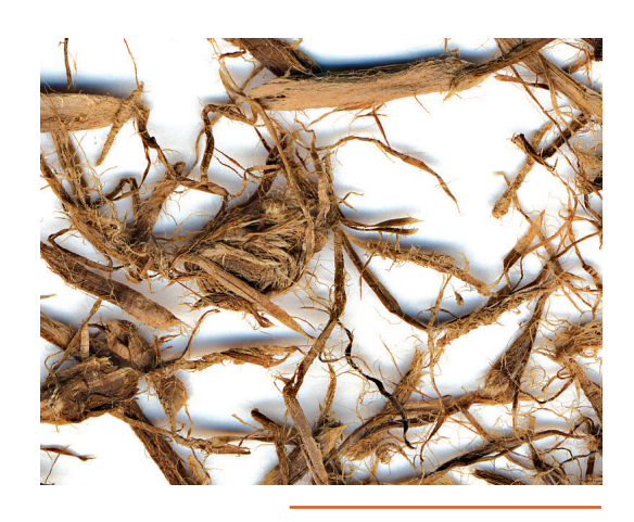
Rejected shives - ready for further processing.